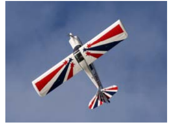
his aerial display at RAC in 2008.